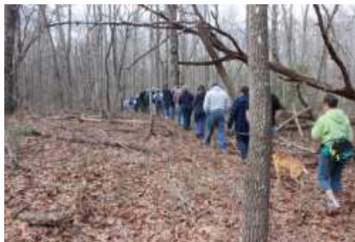
On the trail